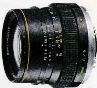
● ZENZANON-S 50mm F3.5