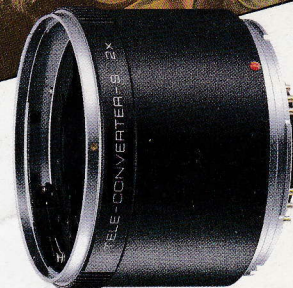
● Tele-Converter S 2X