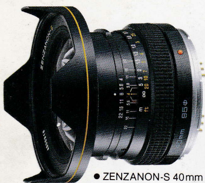
● ZENZANON-S 40mm F4