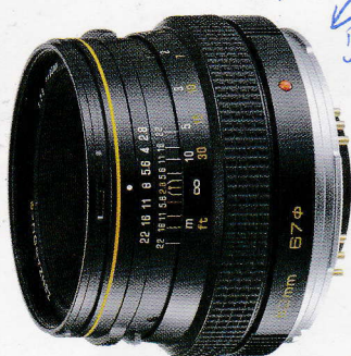
● ZENZANON-S 150mm F3.5