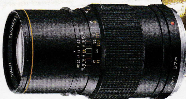
● ZENZANON-S 250mm F5.6