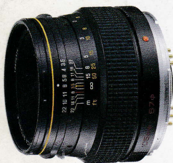
● ZENZANON-S 105mm F3.5