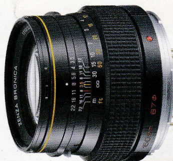
● ZENZANON-S 80mm F2.8