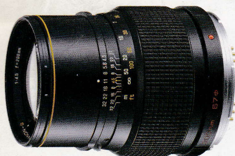
● ZENZANON-S 200mm F4.5